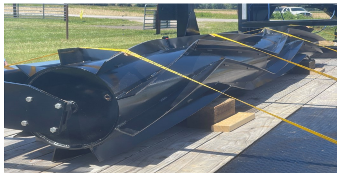
Photo above - This crimper is a 15.5' CAT II 3 point hitch crimper with chevron blades. It weighs in at 3200 pounds and is also water fillable. It requires a 50 HP tractor to pull it. Photo below- Hay bale unroller also made by Tyler Luecke.

allows you to transport your bale to the pasture and unroll it with one piece of equipment. Allowing more animals to get to the food as well as possible bedding in bad weather. If you have any questions for Tyler, call or text him at 812-686-3483.